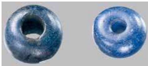
Fig. 9. Blue glass beads from Early Bronze Period II. Left: Hesselager, Fyn. Right: Ølby / Blå glasperler fra ældre bronzealder per. II. TV: Hesselager; TH: Ølby.

Another dimension of the trade in the Bronze Age is textile production as part of the economy. This must have had held