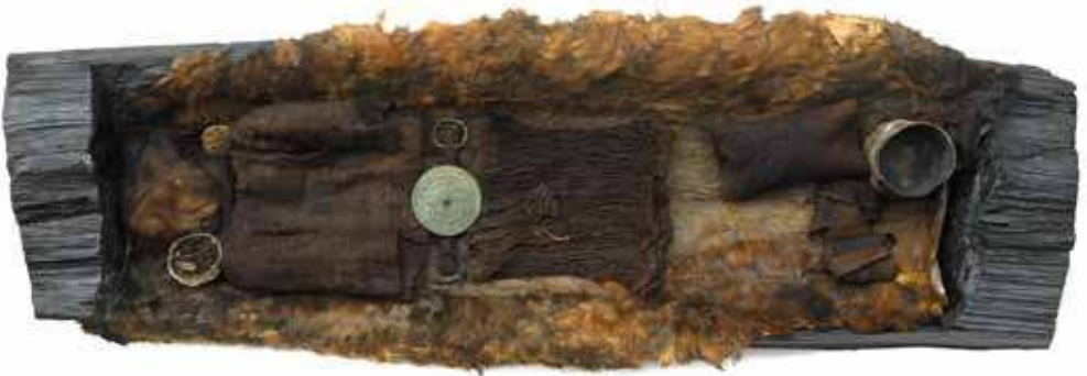
Fig. 1. The Egtved Girl in her coffin / Egtvedpigen i kiste.