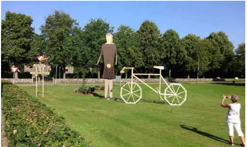
Fig. 5. The Egtved Girl is today an important part of the identity of the local community. Here a 6 m tall Egtved Girl greets the bicycle race 'Post Danmark Rundt' as a symbol of the town / Egtvedpigen er den dag i dag en vigtig del af den lokale identitet i Egtved. Her hilser en 6m høj Egtvedpige cykelløbet 'Post Danmark Rundt' velkommen til Egtved.