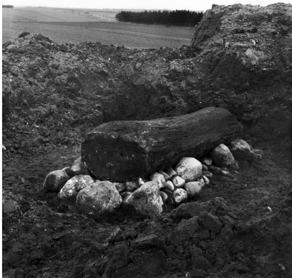
Fig. 2. The coffin in the mound / Kisten i højen 1921.

At the site in Egtved, the lid of the coffin was carefully lifted. The inside of the coffin was exactly as when it had been sealed over 3000 years ago. Nothing was touched on