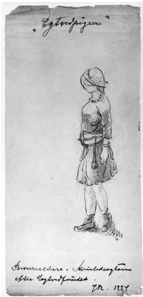
Fig. 4. Sketch drawing by G. Rosenberg 1924 / Skitse tegnet af G. Rosenberg 1924. Illustration: National Museum, Denmark.

The girl's blouse was like the other pieces of clothing made of brown wool. Its cut and design is identical to previously known female blouses from the same period (Broholm 1938: 31). Reconstructions of the Egtved Girl's costume have brought new thoughts on the type of wool used in the Bronze Age which was very fine and brought ideas to what kind of loom that could have been used for the weaving. When studying how the fabric was cut to make the blouse there are signs showing a link to the tradition of working with skin and hide (Broholm & Hald 1935; Alexenderson et. al. 1981; Batzer & Demant 2015).