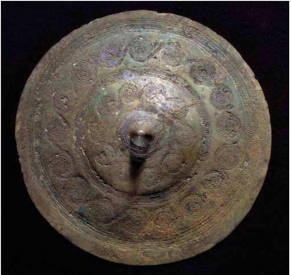
Fig. 3. The Egtved Girl's belt plate / Egtvedpigens bælteplade.

ing in the coffin with the hair towards the body. Under it a big woven blanket had been placed covering the dead. Everything organic in the grave was well preserved and coloured brown due to the acidic and waterlogged conditions in the coffin. Underneath the blanket the remains of a young woman was revealed. She had loose shoulder length hair, cut short at the front. Under her hair, the brain was still in place and the last enamel of her teeth preserved. A small container made of bark was placed near her head. Inside were several personal grave goods; a bronze awl with a wooden